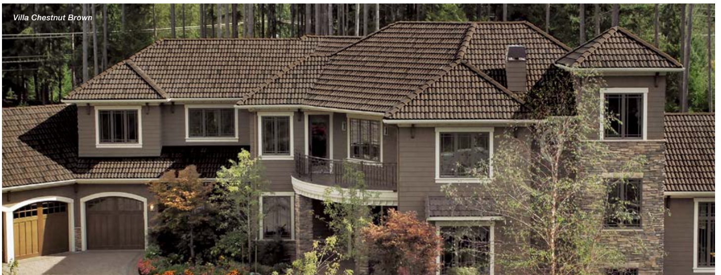
Villa Chestnut Brown